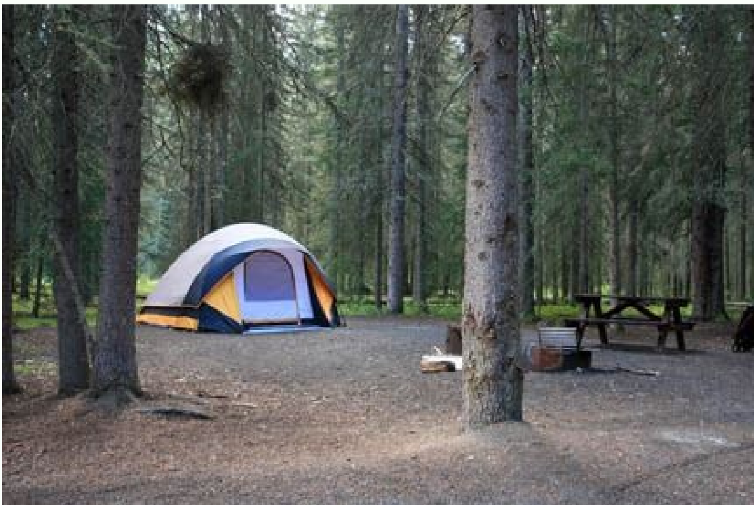
Best way to see Banff and Lake Louise. Best time to visit Banff Canadian Rockies.